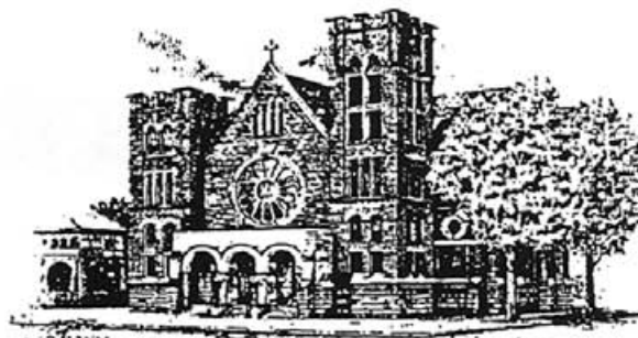
St. Mary Church, 85 S. Sandusky Street, Tiffin, OH 44883 Founded 1831