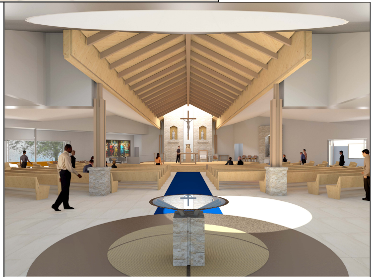
View from the Baptismal Font to the Altar