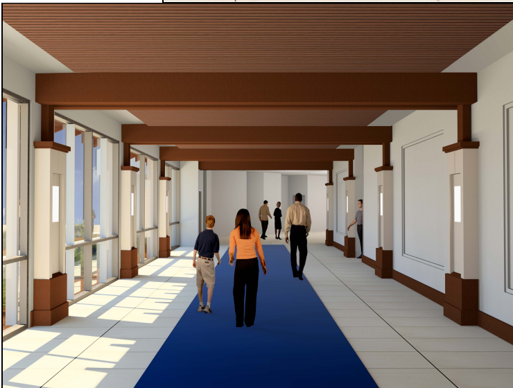
Walkway from Main Entrance to Church