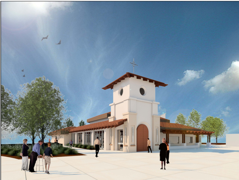
Church Tower Main Entrance

Ascension Catholic Church is a vibrant, welcoming faith community that strives to fulfill its mission to live out the Gospel message of Jesus Christ. As a parish, we have grown and continue to grow. Currently, we have over 39 ministries serving the needs of the parish. Our parish church was designed to be a multi-purpose building. We would like to renovate the interior of this building to make it a true church. This would unify our church campus while also extending the life of our church for future generations. Now is the time to make this dream a reality.